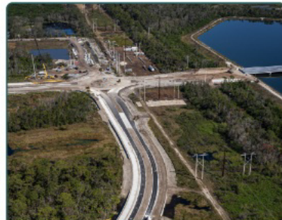
Northward-facing view of construction east of I-75: Northern extension of south Lena Road to the new 44th Avenue East roundabout

Construction activities are active Monday through Friday, between the hours of 7 a.m. and 6 p.m., with Saturday and nighttime work to be conducted on an as-needed basis. Travelers are asked to be mindful of construction equipment and materials being operated and staged in right-of-way areas.